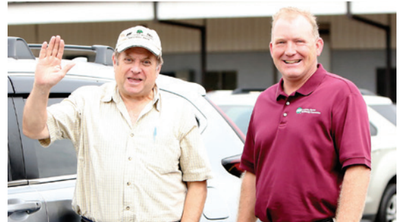
Two grand prize winners each take home $500 cash.